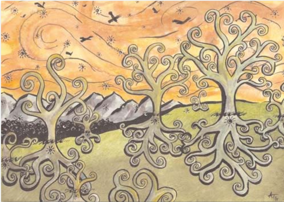
The Parable of the Mustard Seed

June 14, 2015 3rd Sunday after Pentecost