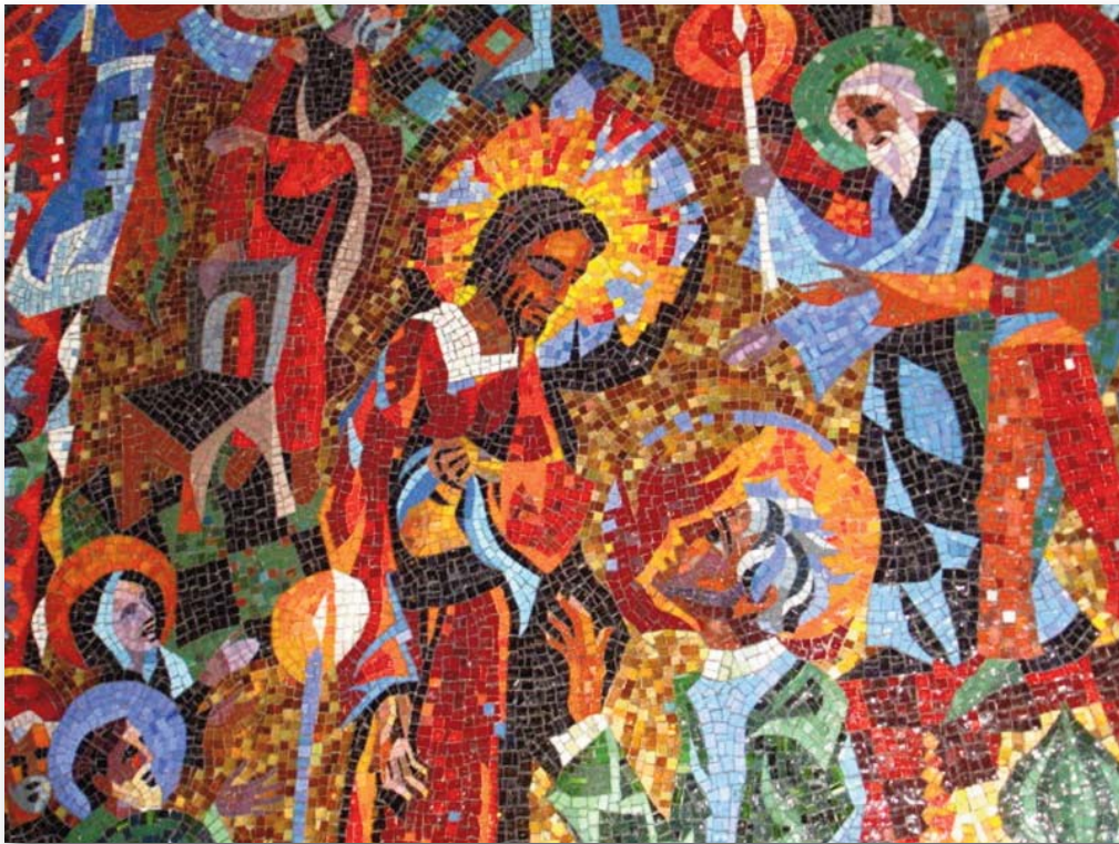
Jesus Appears to His Disciples National Cathedral Mosaic

Look at my hands and my feet; see that it is I myself. Touch me and see; for a ghost does not have flesh and bones as you see that I have. And when he had said this, he showed them his hands and his feet.