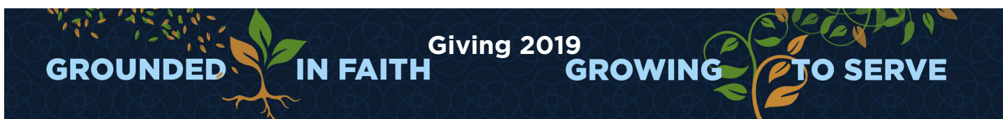
Pledges received as of 12/19/2018