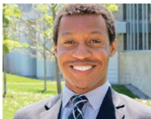
Isaiah Thomas New